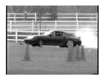
Click movie to begin download.

Check out some of the autocross action at previous events.