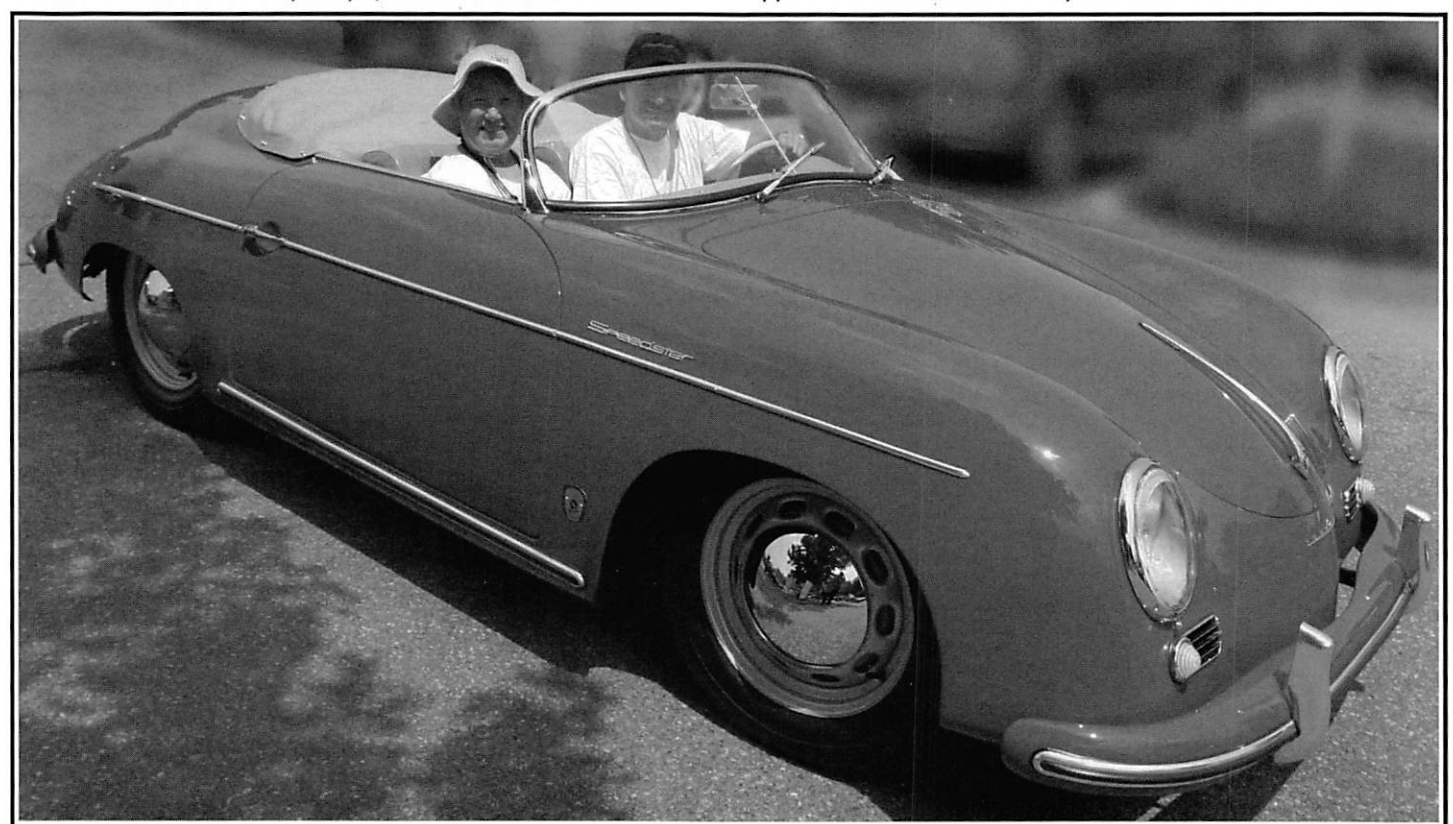
Porschefiles enjoying their 356 Speedster at the '05 Porsche Parade, Hershey, PA

To learn more about the Porsche Type 356, join the 356 Registry at www.356registry.org and plan to attend the 356 Registry 2008 East Coast Holiday Concours at historic Grimes Airfield in Bethel, PA on September 6, 2008. Riesentoter Region is planning a drive to the ECH Concours for a day of fun celebrating Sixty Fast Years and viewing more than 250 very special 356 cars. More info is available at www.EastCoastHoliday.com. Who knows? Like me, you may one day find yourself inspired to owning a Type 356 in addition to your late model Porsche.