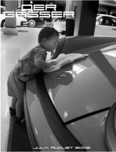
Startin' 'em young