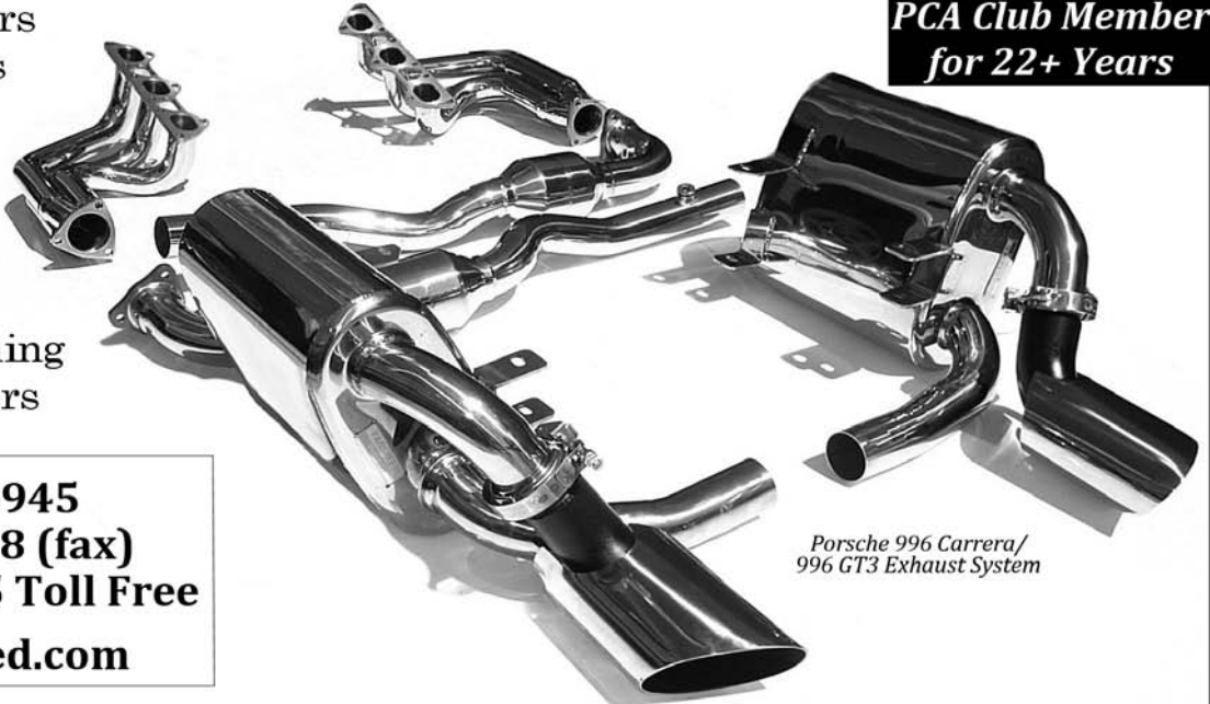
Porsche 996 Carrera/ 996 GT3 Exhaust System

215-646-4945 215-646-9828 (fax) 1-888-646-4945 Toll Free www.fabspeed.com