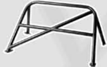
WELD-IN ROLL BARS