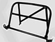
TRULY BOLT-IN ROLL BARS No Cutting, Drilling or Modifications Required