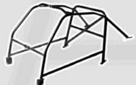
FULL ROLL CAGES