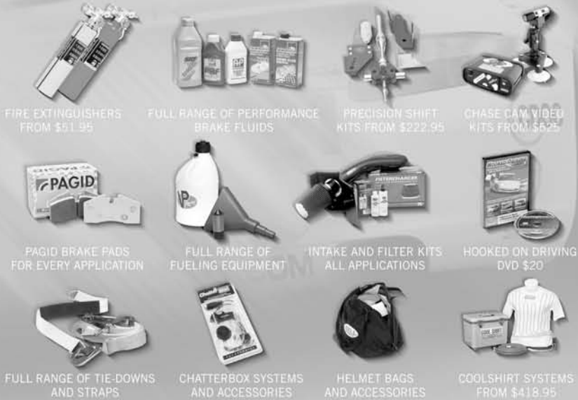
FIRE EXTINGUISHERS FROM $51.95 FULL RANGE OF PERFORMANCE BRAKE FLUIDS PRECISION SHIFT KITS FROM $222.95 CHASE CAM VIDEO KITS FROM $625 PAGID BRAKE PADS FOR EVERY APPLICATION FULL RANGE OF FUELING EQUIPMENT INTAKE AND FILTER KITS ALL APPLICATIONS HOOKED ON DRIVING DVD $20 FULL RANGE OF TIE-DOWNS AND STRAPS CHATTERBOX SYSTEMS AND ACCESSORIES HELMET BAGS AND ACCESSORIES COOLSHIRT SYSTEMS FROM $418.95