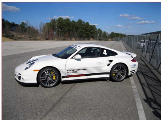
Instructor's 911 Turbo