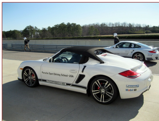
Instructor's Boxster Spyder