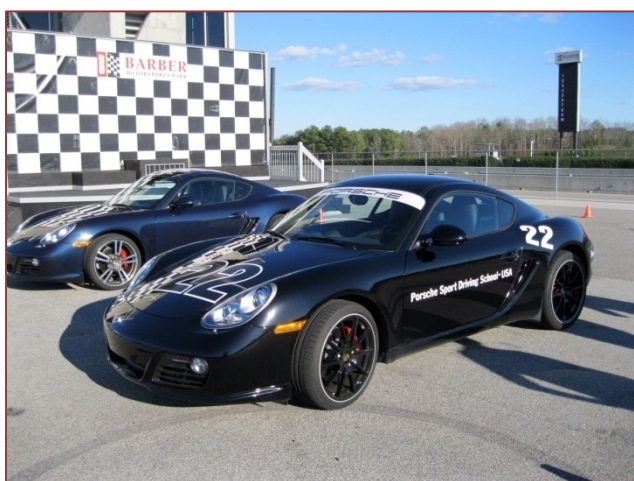
Caymans for the Cornering Exercises