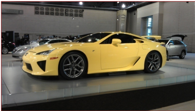
Lexus LFA 2012

It's been several years since we last attended the Philadelphia Auto Show and it was a pleasant surprise this year to find a well organized and extensive display of past and present vehicles. My wife and I appreciate examples of fine automotive engineering and there was plenty to see. Although we do lean towards the coupe style over the sedan or larger, there were some nice examples of those "other" vehicles on display. As usual the show was held at the Philadelphia Convention Center which had 600,000 square feet devoted to the show. Toyota even had a first ever indoor ride and drive event (at low speed mind you). The main display was held on the upper level while the aftermarket DUB Show was held on the lower level.