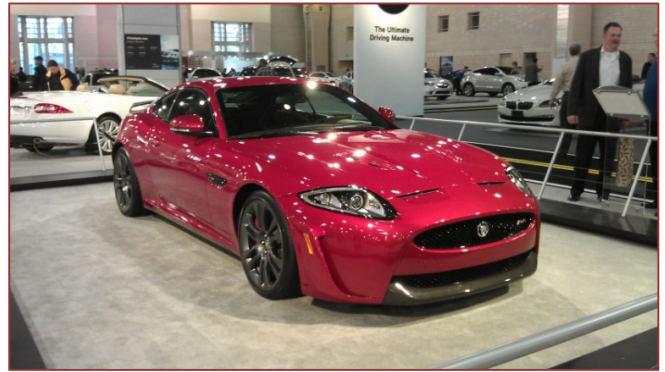
Jaguar XKR-S Coupe