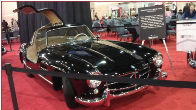
1956 Mercedes 300SL Gull-wing