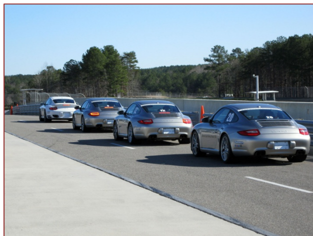
Drivers getting ready to enter the track