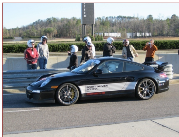
Waiting for the Hot Lap in a GT 3