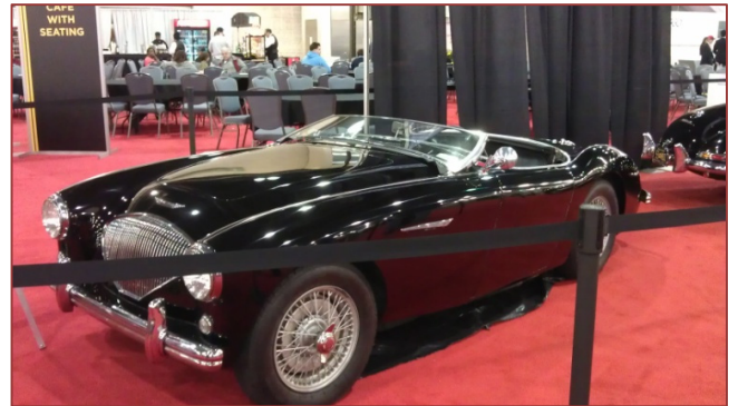
1955 Austin Healey 100M