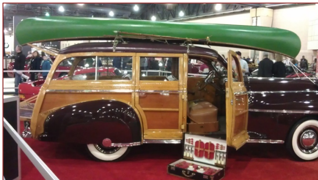
From the New Hope Auto Show Group