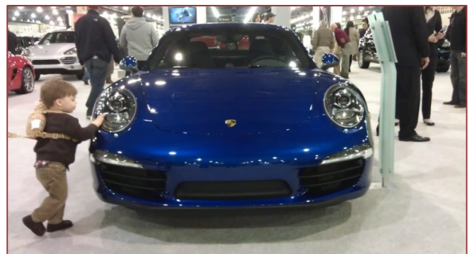
"Porsche – There is no substitute"