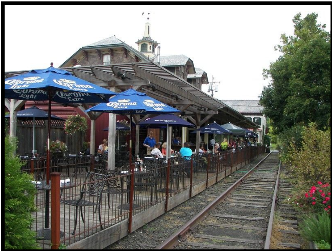
Outdoor seating at the Station