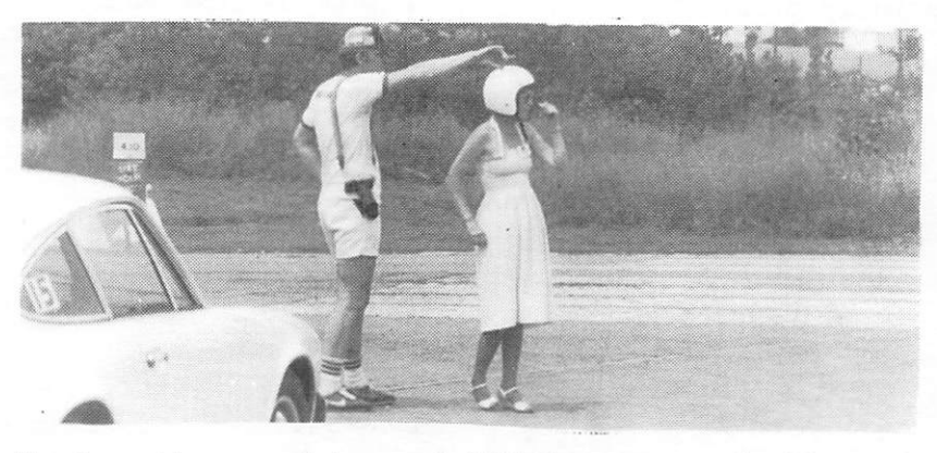
Go down there and turn at WHICH orange pylon??