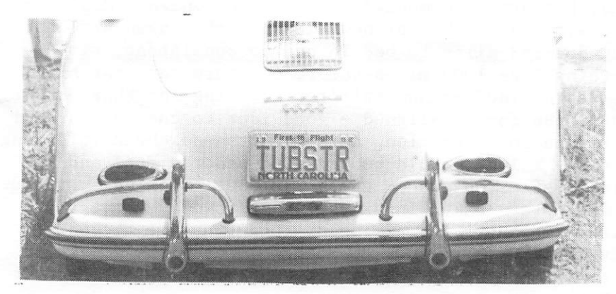
. There will always be Speedsters!