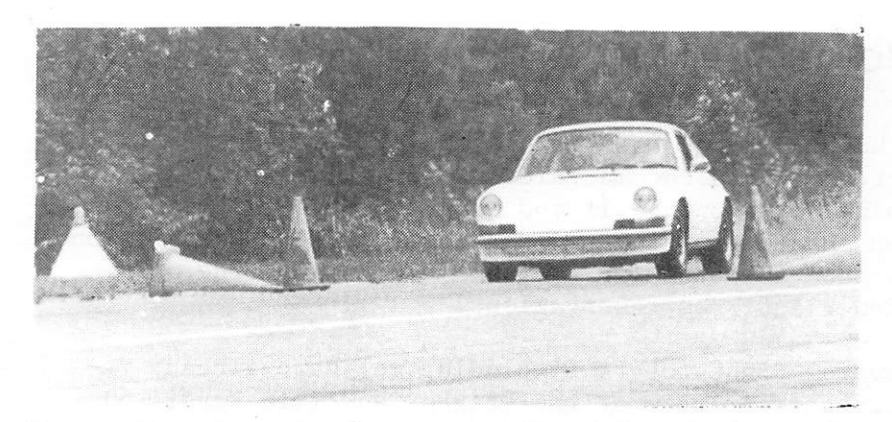
Your male editor trying to get it right; look at that line, notice the balance - if only he was in the right gear!