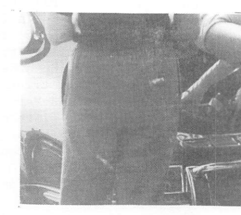
Concours judge armed with a coil wiring