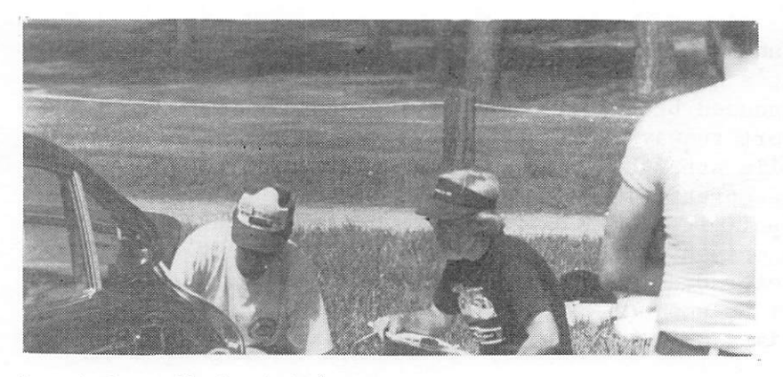
1st judge: Ohmigod it's dirty inside this exhaust pipe!